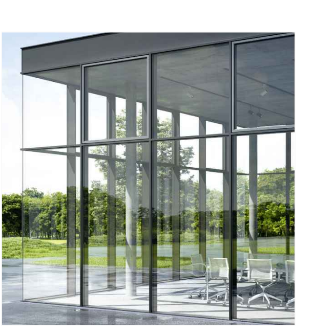
03 - Schueco FWS50 Aluminium glazing facade system or eqiv. in dark grey with solar control double or triple glazing. Frame system target u-value of 0.9W/m<sup>2</sup>K or better