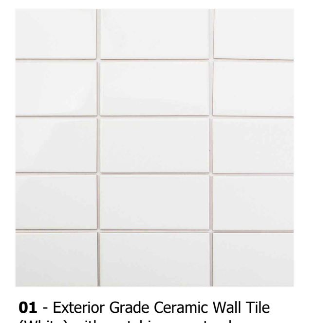
(White) with matching grout colour -High impact resistance - frost proof marine grade