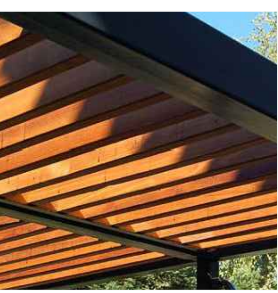
07 - vertical timber slat canopy set into dark grey metal frame to match glazing