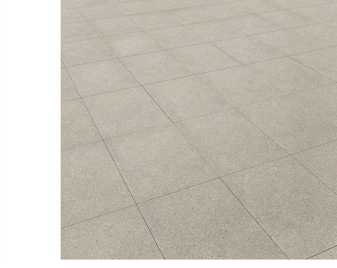
11 - Marshalls Perfecta Smooth Ground Flag Paving with Yorkstone aggregate (or similar) to main terrace area replacing existing patchwork of paving