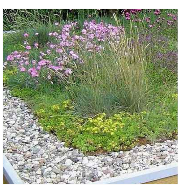
06 - Sedum roof with gravel perimeter drainage and internal drainage