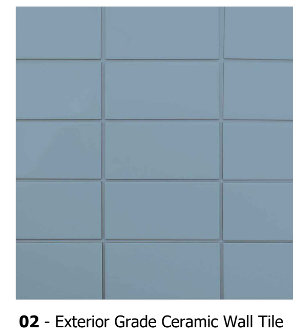
(Colour TBC) with matching grout colour - High impact resistance - frost proof marine grade