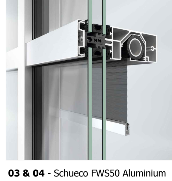
glazing facade system or eqiv. (03) with integral blind system (04)