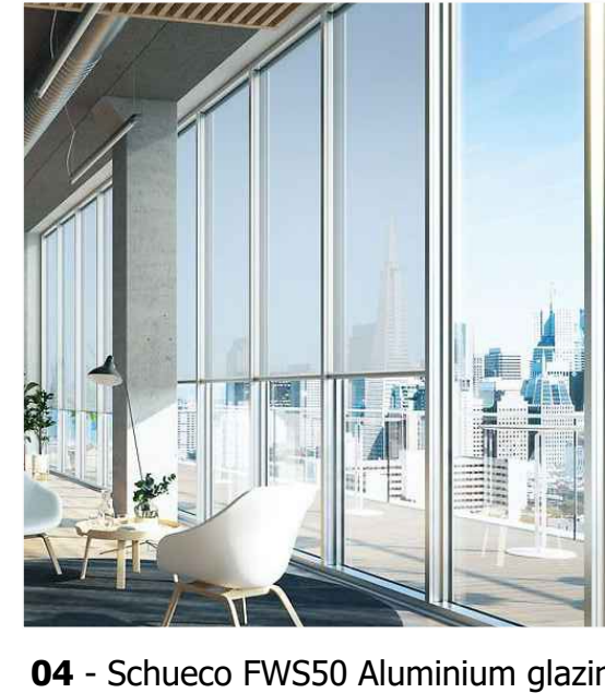
04 - Schueco FWS50 Aluminium glazing facade system integral blind system for solar gain & glare control. Colour TBC and transparency levels subject to detail calculations