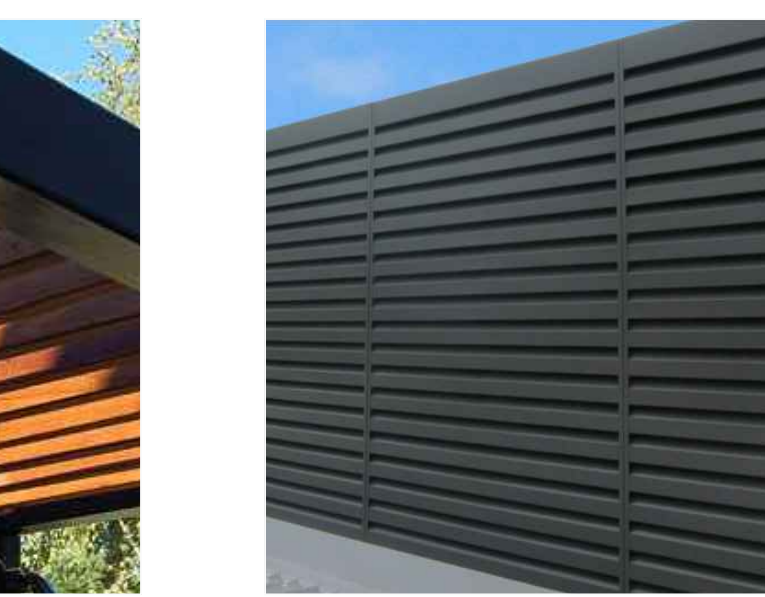
08 - Dark Grey acoustic louvres colour matched to zinc roof finish (05)